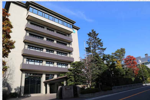
Shimano Inc. Osaka, Japan