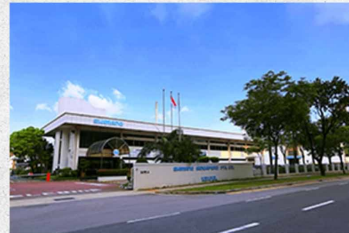
Shimano (Singapore) Pte. Ltd